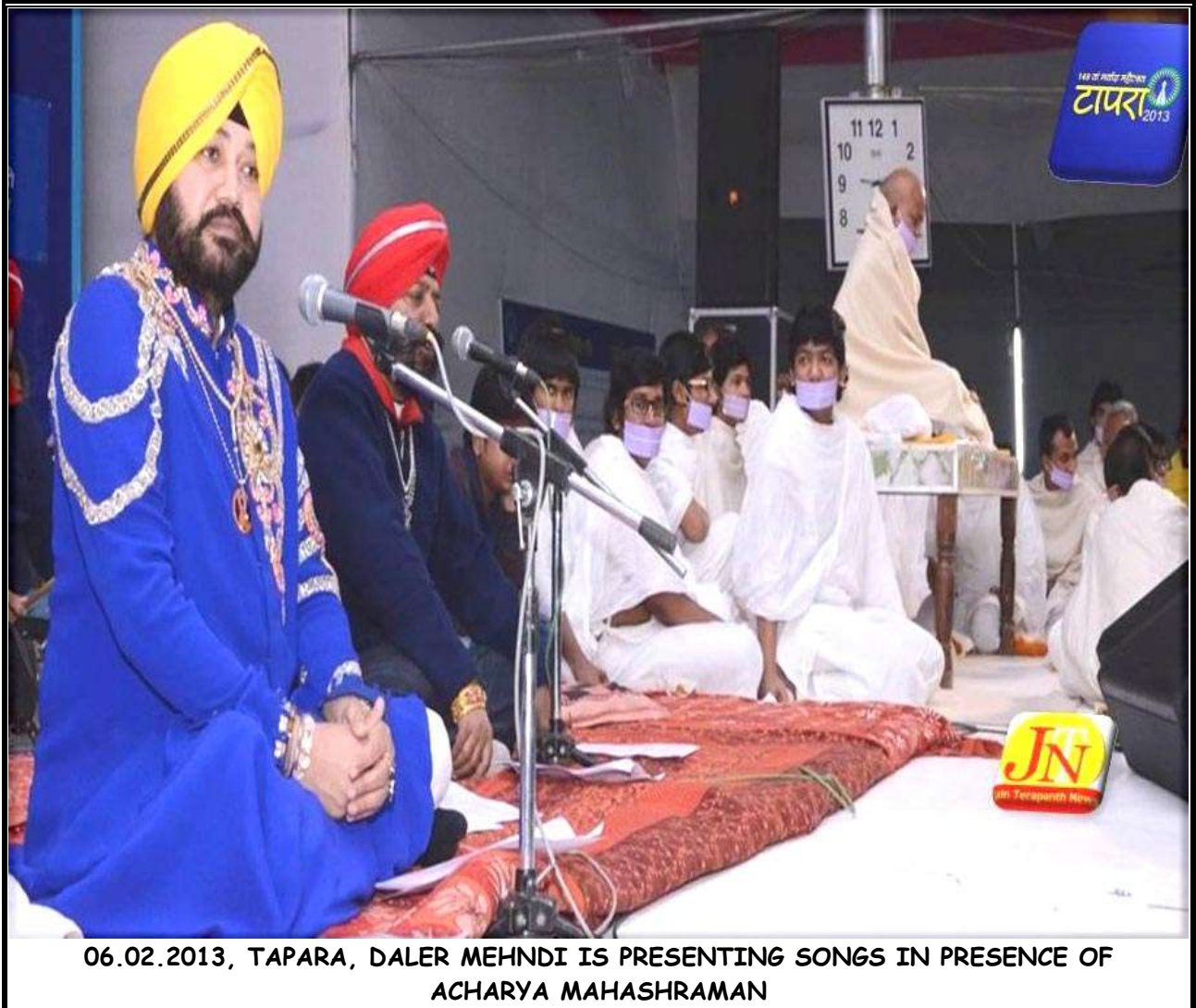
06.02.2013, TAPARA, DALER MEHNDI IS PRESENTING SONGS IN PRESENCE OF ACHARYA MAHASHRAMAN